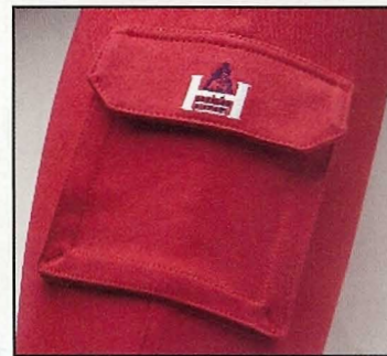
Detail of cargo breech